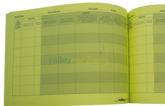
Traditional CD Register