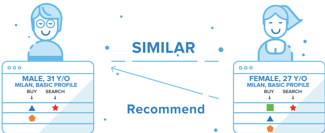
Figure 1 - The idea behind Collaborative Filtering is that products which were bought together are more likely to be preferred by Customers who are similar to each other

brood of search engines thanks to a clever searching filter which is now known as Page Rank (remarkably, in its personalized version Page Rank logic is actually one of the solutions available for building recommendation engines). In general, Recommendation Systems can be understood as an information filtering tool aimed at personalizing item contents to individual users , given a limited information set related to said users (Fig. 1)